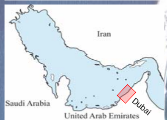
Figure 1: Dubai, UAE