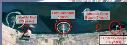
Figure 2: Four artificial reefs of different ages